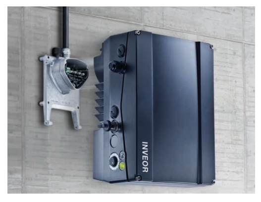
Our universally applicable INVEOR line of drive controllers can be assembled both motorintegrated and motor-close. So, e.g. also wall mounting is possible.