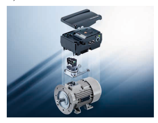
For everyone the suitable solution: Our INVEOR line of drive controllers is constructed for universal use. Of course, the INVEOR allows the possibility to adapt to the customer's needs easily.