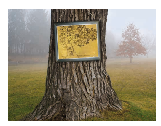
The KOSTAL family has developed and branched out continuously. Due to the common roots we form a strong community in which everyone can rely on the other.